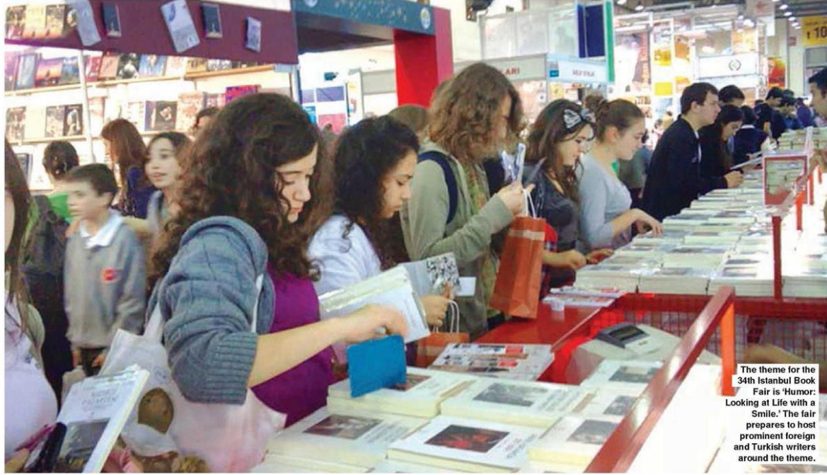
The theme for the 34th Istanbul Book Fair is 'Humor: Looking at Life with a Smile.' The fair prepares to host prominent foreign and Turkish writers around the theme.